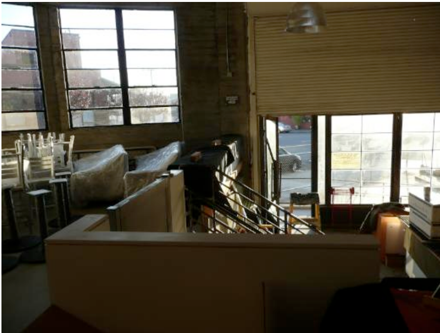
Upstairs: the lounge area to the left and counters around the edges.