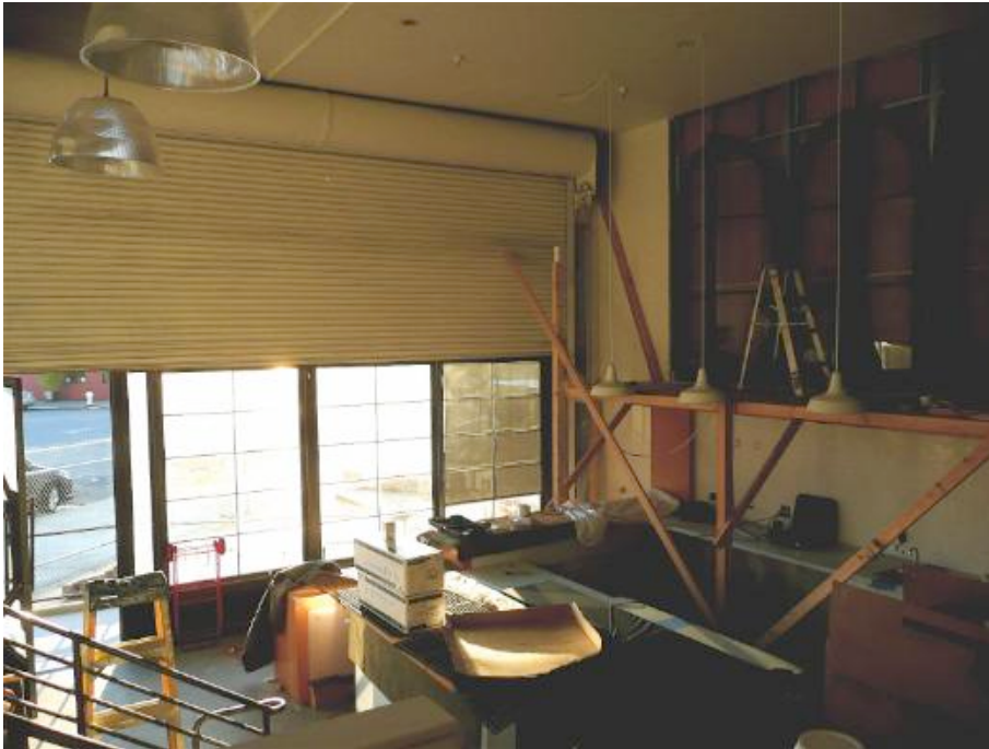
The main floor and coffee counter. Note the loading dock door in the window.

and the outside area will have some bistro tables (the fencing will remain so you can drink/smoke al fresco ). Upstairs, there will be communal tables on one side, a loungey area on the opposite side and counter seating bordering the entire overhang. Also upstairs: a tasting room and a (surprisingly large) kitchen. They are hoping to soft-open within the next couple weeks, since they've got the Mr. Espresso coffee ready to roll out, but it might take them longer to sort out the non-coffee details. Seriously, coffee bars will soon be the new wine bars.