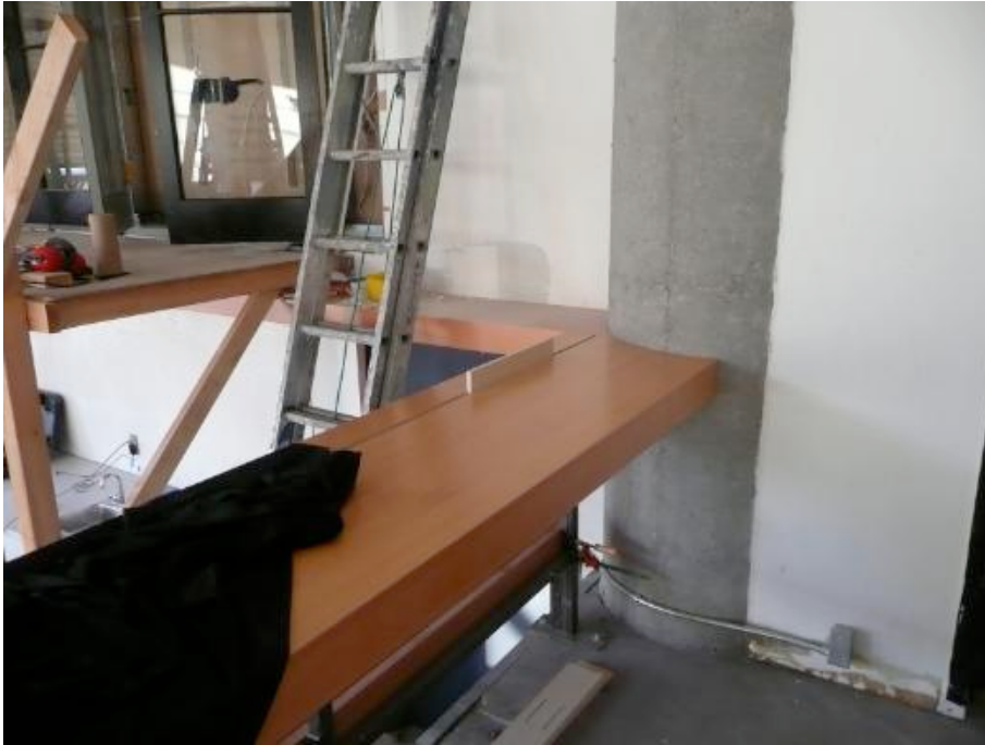
Upstairs: See that? That's a custom wood counter, baby.